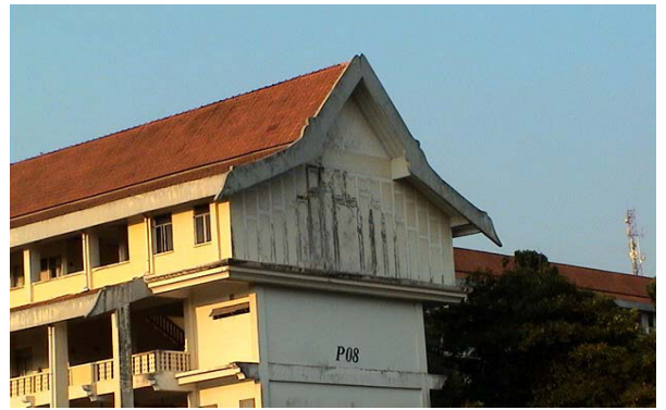
Fig. 1. The UTM electrical engineering building (Block P08) that was struck and damaged by lightning at the southern ridge end.

Surveys of buildings in the UTM campus carried out by Hartono and Robiah also showed that many buildings that were equipped with the ESE system have been struck and damaged by lightning, some repeatedly (Figs. 1 to 3). They also observed that buildings that were installed with correctly positioned FR had shown no signs of being damaged by lightning strikes even though some of these buildings were located on higher grounds and hence more exposed to lightning.