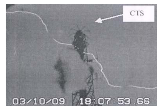
Fig. 5. One of the photographs that was claimed to show the lightning flash "crossing" the tower.