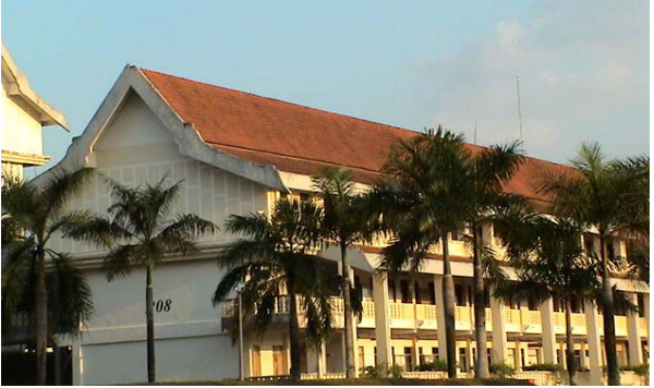
Fig. 2. The same building was also struck and damaged by lightning at the northern ridge end. The silhouette of the ESE system can be seen on the roof at right about 20m away.